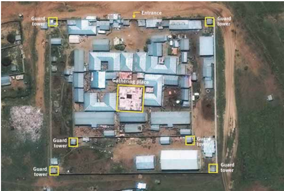
Satellite image of Jail Ogaden May 2016.