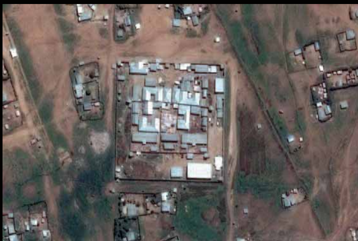
Satellite image of Jail Ogaden, Jijiga, Ethiopia, recorded on May 27, 2016.

The many accounts of detainee mistreatment in the report underscore the urgency for the new Ethiopian Prime Minister, Dr Abiy Ahmed, to take immediate steps to address human rights abuses in the Somali region, including in Jail Ogaden. His government should ensure respect for prisoners’ due process rights, and that they face no mistreatment. The government should investigate abuses documented in this report, substantially reform the Liyu police and hold senior officials to account for serious crimes, including torture in Jail Ogaden.